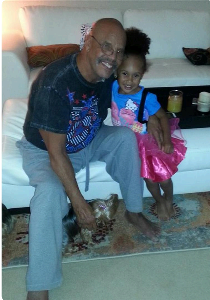
Grandpa & Leela